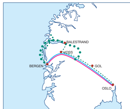
ACROSS THE ROOF INCLUDING VOSS INCLUDING BALESTRAND